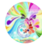
Sylvia H 4 2