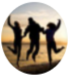
marymitchell Gainesville, Georgia 13 1