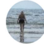
ravenlady Mount Vernon, Washington 199 92