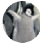
Tiffany S 6 2