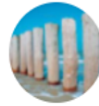
Insgirl4543 Denver, Colorado 17 3