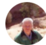
jdb91758 Holland, Pennsylvania

See all 7 reviews by lambo98a for New Orleans