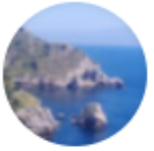
daljalil Colorado Springs, Colorado