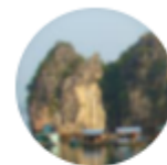
W9827HMjoem Carlsbad, California 👍 2

🌟🌟🌟🌟🌟 Reviewed December 25, 2017 📱 via mobile