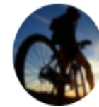
Cat L Cambridge, Massachusetts

See all 6 reviews by Lynsee E for New Orleans