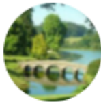
Judy13231607 Atlantic Beach, Florida 10 6

See all 4 reviews by amwmakon for New Orleans