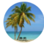
lambo98a Seattle, Washington