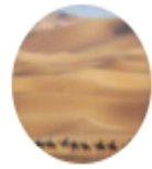
David L 5 1