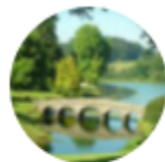
Judy13231607 Atlantic Beach, Florida 👍 10 🗣️ 6

🌟🌟🌟🌟🌟 Reviewed November 30, 2017 📱 via mobile