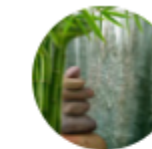
mermaid1212 Boston, Massachusetts 3 1