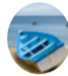
RoseRN199 Orange, California 39 7